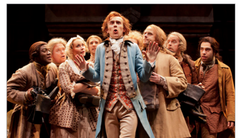
Ensemble cast in She Stoops to Conquer (Johan Persson)