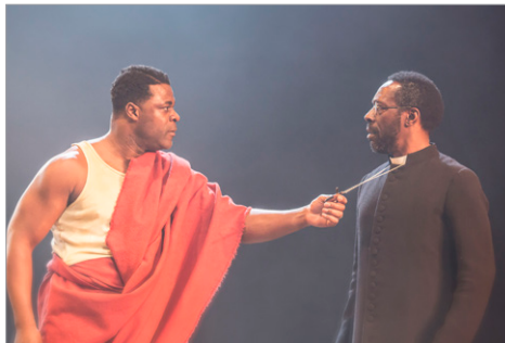
Danny Sapani and Gary Beadle in Les Blancs