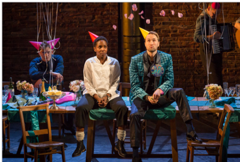
Ensemble cast in Twelfth Night (Marc Brenner)

The National Theatre's mission is to make world class theatre that's entertaining, challenging and inspiring – and to make it for everyone. It aims to reach the widest possible audience and to be as inclusive, diverse and national as possible with a broad range of productions that play in London, on tour around the UK, on Broadway and across the globe. The National Theatre's extensive UK-wide learning and participation program supports young people's creative education through performance and writing programs like Connections, New Views and Let's Play. Its major new initiative Public Acts creates extraordinary acts of theatre and community; the first Public Acts production was 2018's Pericles . The National Theatre extends its reach through digital programs including NT Live, which broadcasts some of the best of British theatre to over 2,500 venues in 65 countries. The National Theatre invests in the future of theatre by developing talent, creating bold new work and building audiences, partnering with a range of UK theatres and theatre companies.