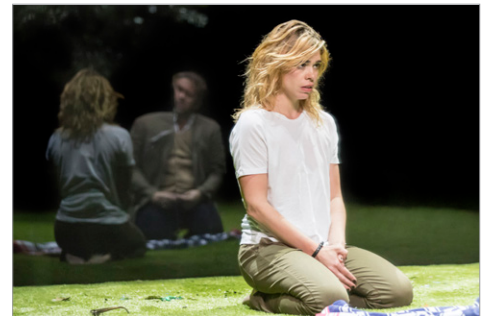
Billie Piper in Yerma

For more information or to sign up for a free trial, visit