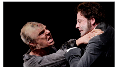
Benedict Cumberbatch and Jonny Lee Miller in Frankenstein